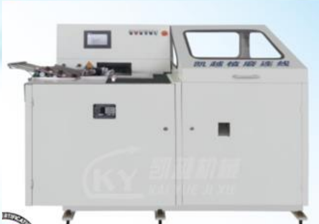
Two Color Cnc Toothbrush Tufting, Trimming and End-Rounding Machine